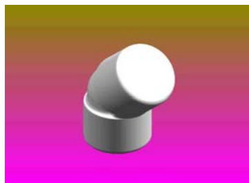
400, 3000 & 6000 PSI BLANK S.W., 45 DEG ELBOW