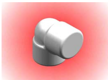
400, 3000 & 6000 PSI BLANK S.W., 90 DEG ELBOW