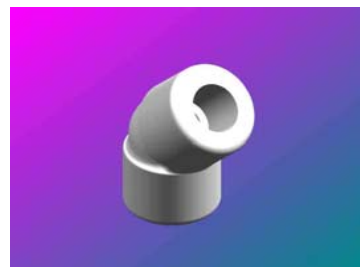
3000 PSI S.W., 45 DEG ELBOW