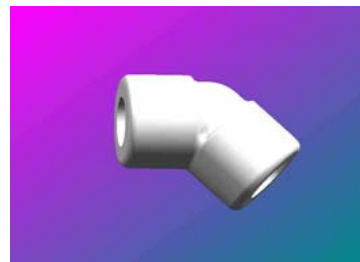
3000 PSI S.W., 45 DEG ELBOW