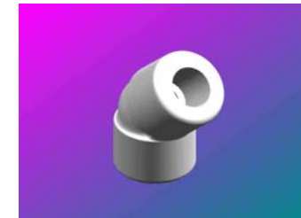
3000 & 6000 PSI S.W., 45 DEG ELBOW