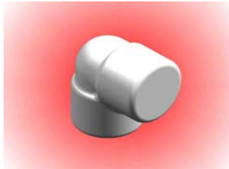
3000 & 6000 PSI BLANK S.W., 90 DEG ELBOW

ANSI B16.11, 3000 & 6000 PSI 2177966 257003