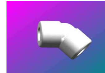
3000 & 6000 PSI S.W., 45 DEG ELBOW