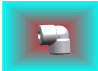
3000 & 6000 PSI S.W., 90 DEG ELBOW