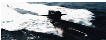
• LOS ANGELES CLASS- SSN