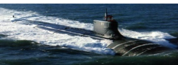
• SEAWOLF CLASS- SSN