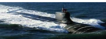
• SEAWOLF CLASS- SSN