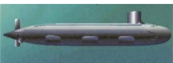
• VIRGINIA CLASS- SSN