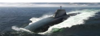
• DREADNOUGHT CLASS- SSBN