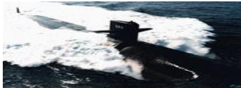
• LOS ANGELES CLASS- SSN